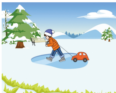
a. Dragging car across lake