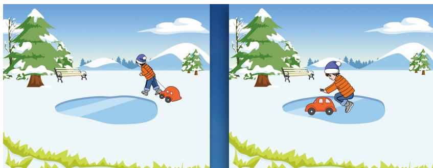
b. Dragging car AROUND lake