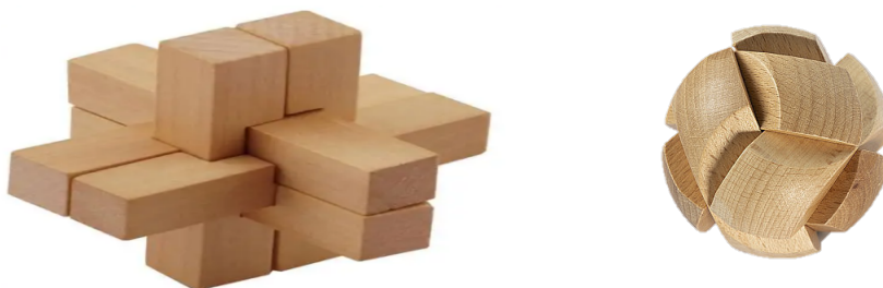
Figure 1 The Externals of Luban Locks

Among the wide variety of educational toys, the Luban Lock (Figure 1) — a representative traditional Chinese educational toy— originated from the mortise and tenon structure in ancient Chinese architecture (Fu & Chen, 2021; He et al., 2020; Liu & Leng, 2019; Ying, 2016). It forms a stable structure through the interlocking of concave and convex parts of wooden pieces, without the use of nails or rivets, thereby embodying the craftsmanship and mathematical thinking of ancient people (Yang et al., 2022; Zhang et al., 2017). The Luban Lock itself integrates scientific inquiry and social cooperation: the mortise and tenon structure serves as a natural material for children to explore the relationship between parts and the whole, while the assembly process inevitably fosters negotiation, division of labor, and cooperative behaviors (Shang et al., 2025; Tanaka et al., 2014). This carrier characteristic, which embeds scientific principles in objects and integrates social rules into activities, realizes in-depth integration and mutual promotion between the two domains. It holds important theoretical value and practical significance for promoting the innovation and development of preschool education in the context of cultural confidence in the new era.